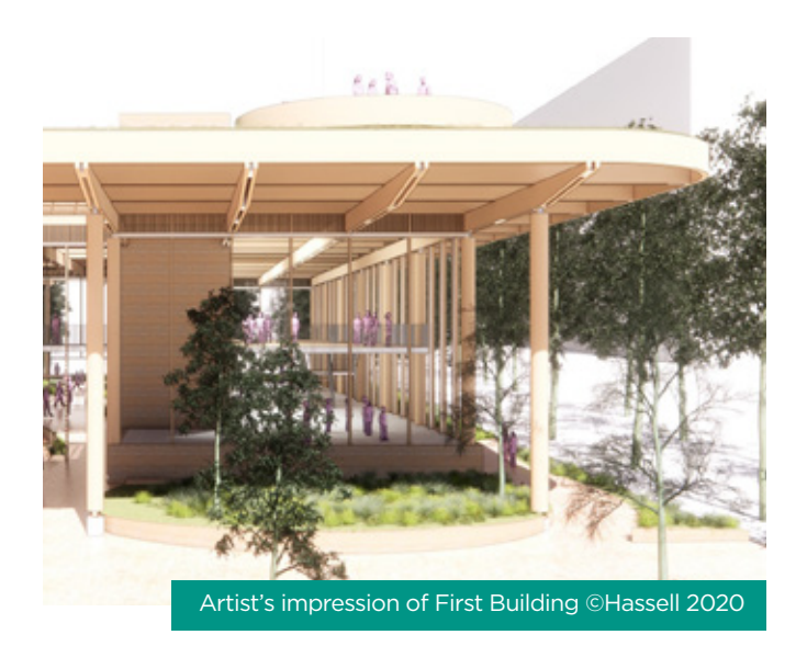
NETM - a new way forward for skills training

We will work with representatives of the local Aboriginal community and with Liverpool City Council to give the first building in the Bradfield City Centre a First Nations name. We will also work with cultural leaders, the community and council to help identify a range of suitable names for other Bradfield City Centre features to reflect and honour our multicultural communities as well as the people and achievements of the past that have helped to shape the Western Parkland City.